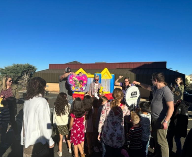
11/12/2023 - Reaching HOPE Birthday Party!

In 2023, Reaching HOPE had a larger impact than ever before.